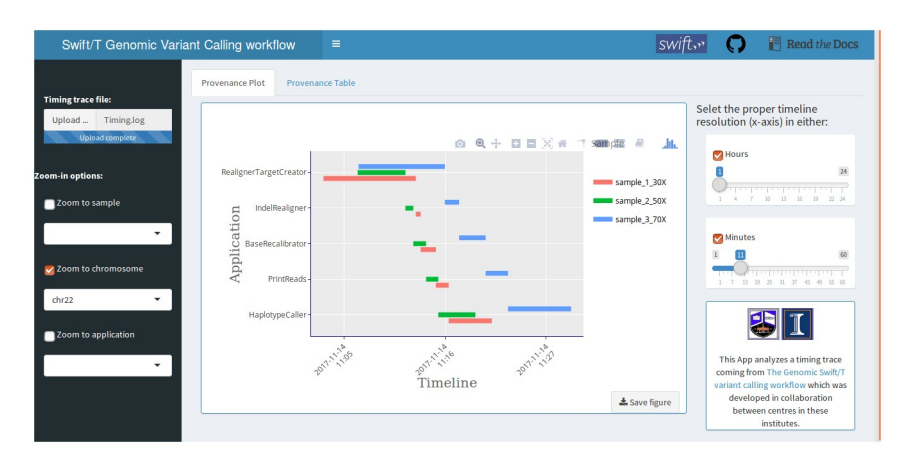
Fig 2. Timing provenance tracking of a 3-sample pipeline run (synthetic whole exome sequencing dataset at 30X, 50X and 70X) on Biocluster [50]. This plot view is interactive, allowing full pan and zoom and was generated using plotly library in R.

https://doi.org/10.1371/journal.pone.0211608.g002